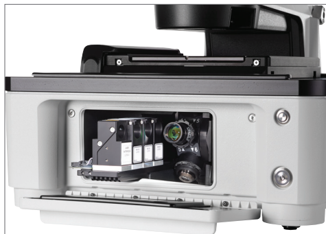
Easy access to filter/LED cubes and objectives.

See www.biotek.com for complete list of accessories.