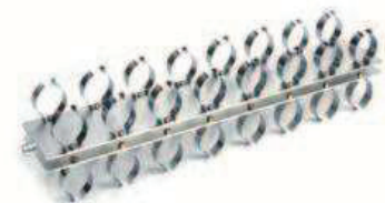
VM80-C Tube Holder Frame: 50ml Sharp Bottom Tube x 16