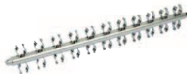
VM80-B Tube Holder Frame: 15ml Sharp Bottom Tube x 22